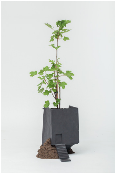
LITHIC ALLIANCE "UNDERGROUND VISITS" stoneware 35x38x21