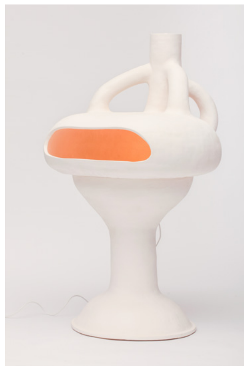
ABEL JALLAIS "REQUIN-FOYER" engobe 1105° . light . stoneware 125x65x65