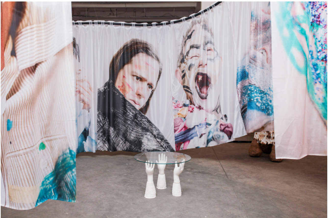
WET ROOM | ADAF 2023