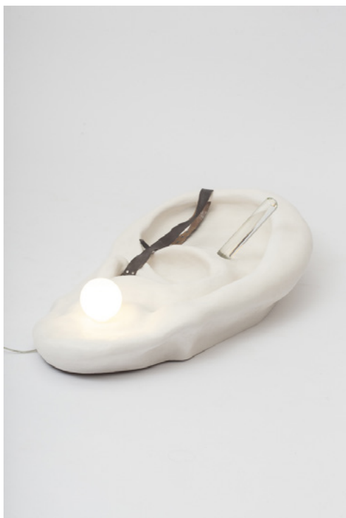
ALINE BOUVY "PRICK UP" electrical device . fiberglass . glass . jesmonite . leather . light bulb . metal . pigment 93x46x10