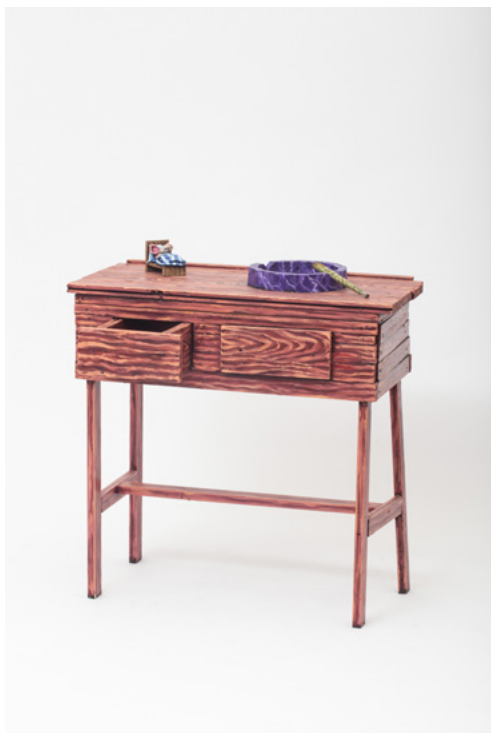
REMI LAMBERT "STONER'S CONSOLE (THE MOUSE'S DREAM)" oil paint . paper . wood 80x80x56