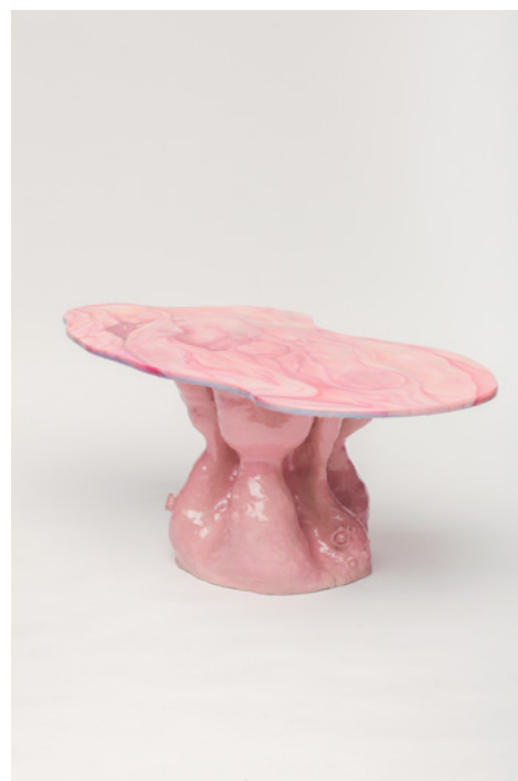
CAROLE MOUSSET "WHY DON'T YOU COME INSIDE?" oil on wood . epoxy enameled stoneware Variable dimensions