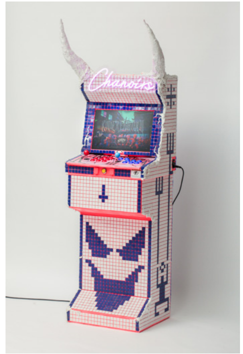
CHANOIRS "KINDERFIGHTER III" tiles . electronics devices 160x40x50