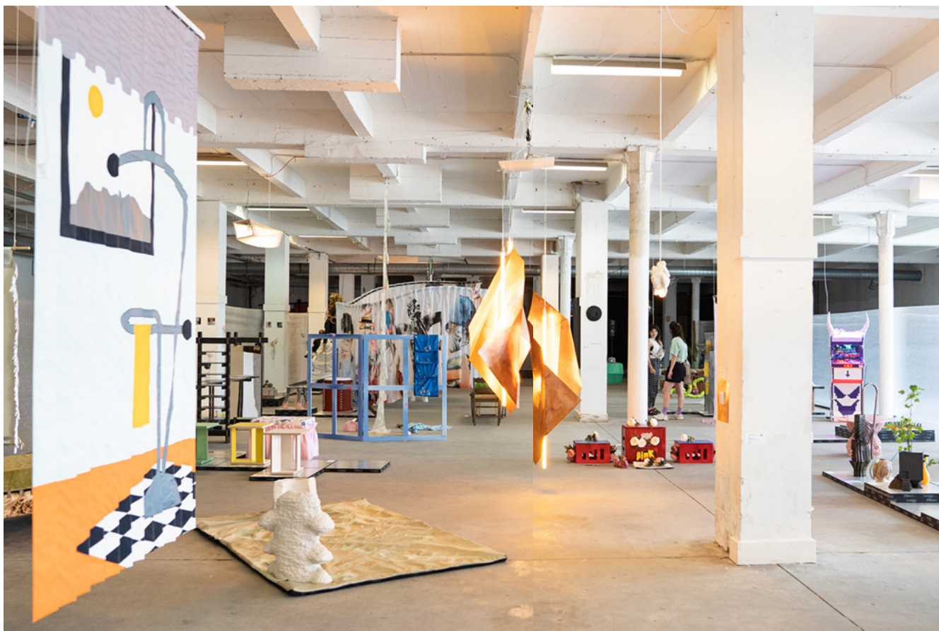
HEAT THE ROOM | ADAF 2023